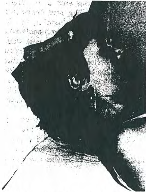
Fig. 1. Palpation of the posterior arch of the atlas.

the pain spots were often situated in particularly dense parts of the scar, where acupuncture needles would be useless.