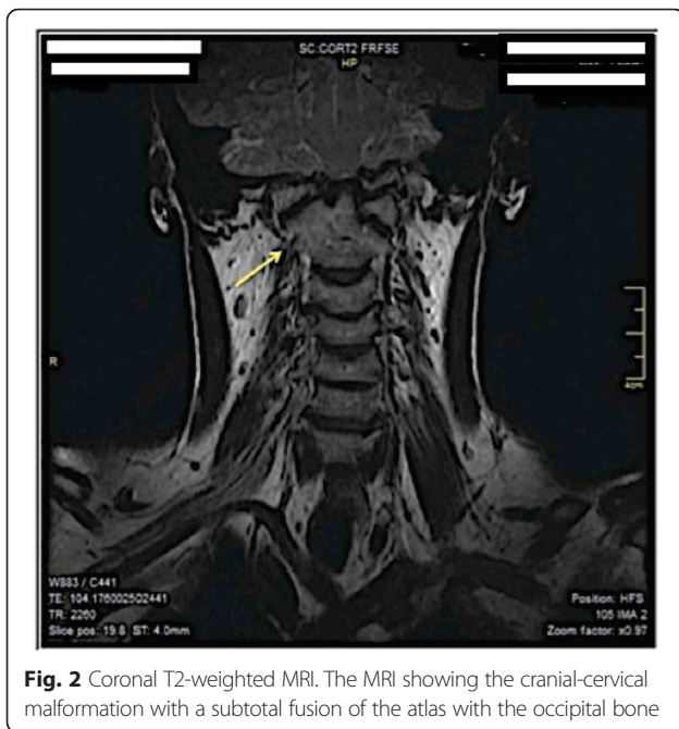
Fig. 2 Coronal T2-weighted MRI. The MRI showing the cranial-cervical malformation with a subtotal fusion of the atlas with the occipital bone