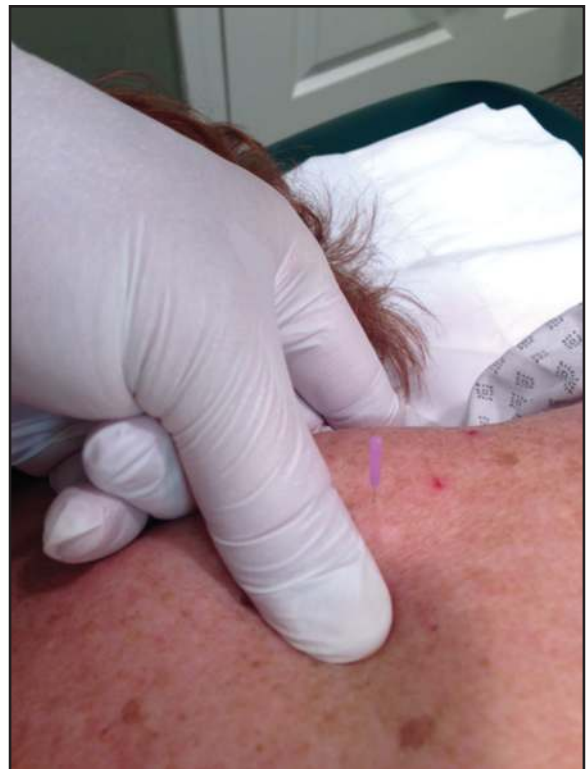
Figure 2. Levator Scapula teno-osseous junction needle insertion

DN of the supraspinatus muscle T-O junction (Figure 4) was performed using palpation to locate the tender nodule in the muscle belly. A 30 mm. needle was inserted toward the supraspinous fossa, where periosteal pecking (ten "taps") was performed just superior to the scapular spine. The needle was then left in-situ for 15 minutes.