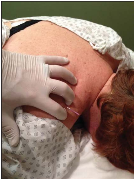
Figure 4. Supraspinatus teno-osseous junction needle insertion

DN of the infraspinatus muscle (Figure 5) was performed using flat palpation to identify the location of the tender nodule in the taught band of muscle located one-third the distance from the scapular