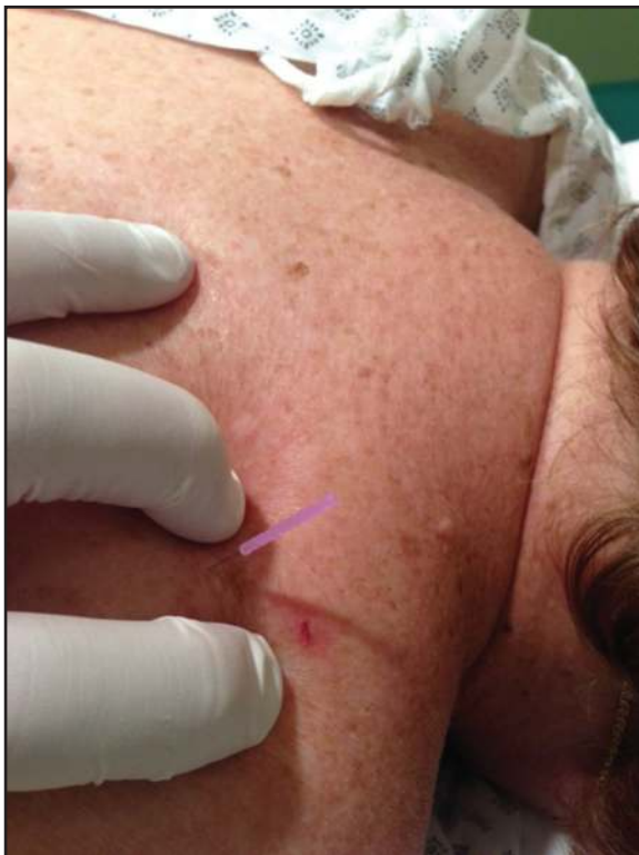
Figure 1. Levator Scapula musculoskeletal junction needle insertion

All DN was performed according to the Dry Needling Institute of the American Academy of Manipulative Therapy's current educational programing. 35 The patient was prone for all DN insertions. DN to the LS (Figure 1) was performed using a 30 mm. needle inserted through the muscle belly and tangential to the plane of the chest wall. The DN technique utilized ten fast-in/ out movements in a cone pattern to attempt to target as many sensitive loci as possible within the tender nodule in the taught band of muscle. The needle was then wound clockwise repeatedly to attain needle grasp and was left in-situ for 15 minutes.