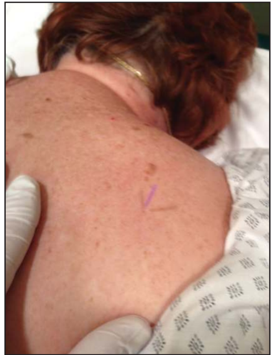
Figure 5. Infraspinatus muscle belly/teno-osseous junction needle insertion